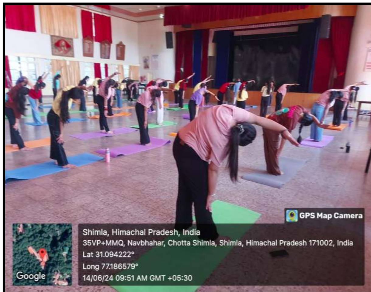
Students Learning Yoga

Yoga Camp and National Webinar on International Yoga Day (June 13-14, 2024)