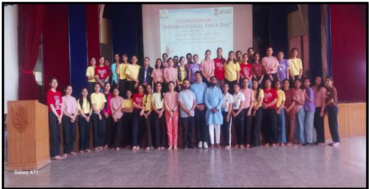
Yoga Session Day-II

Yoga Camp and National Webinar on International Yoga Day (June 13-14, 2024)